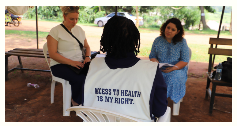
SIND partners engaging with an MHU volunteer during the visit

The visit lasted one week and the representatives from SIND spent alot of time engaging with staff, clients and health providers to have a feel of the day to day running of activities and the impact on clients' lives.