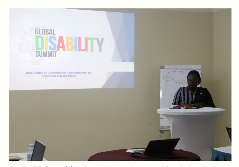
Ministry of Gender representative presenting during the meeting

This is part of the MHU underlying principle of ensuring that rights of persons with disabilities are respected and upheld in all aspects of society engagement.