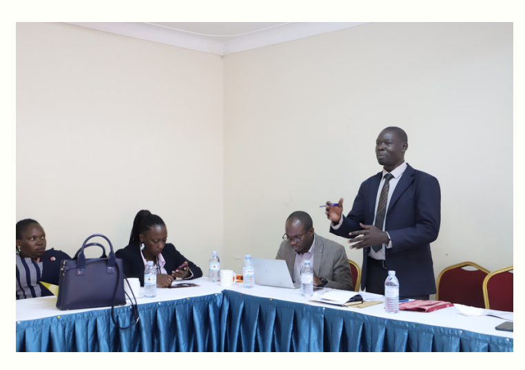
A representative from Ministry of Education sharing during the meeting