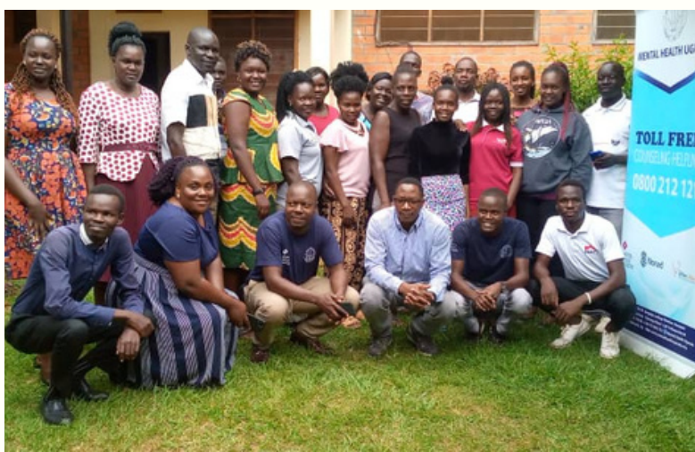
Group photo of Mentor Champions, FocalTeachers and MHU staff after a training in GUIu