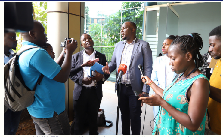
MHU ED speaking to the press at the court premises

Some notable activities that took place over the last quarter