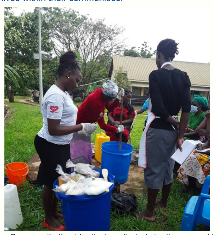
Peers practically mixing the ingredients during the soap making training

What was unique about this training is that it was led by peers who were also earlier rehabilitated under the same project and are now leading independent and meaningful lives within their communities.