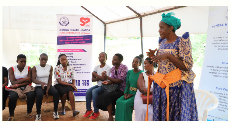
A project beneficiary sharing during an engagement with SIND partners