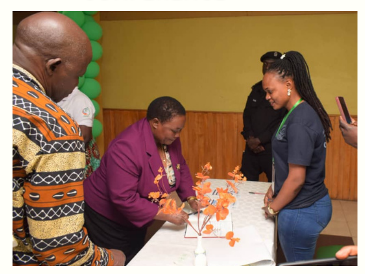
MHU staff with the Honourable Prime Minister at the MHU display table

The Ministry of Health, National Mental Health Working Group, Uganda Counselors Association and partners in the Mental Health Space organized a 3 day conference under the theme; "Prioritizing Mental Health Through Community Involvement: Together for Mental Health.