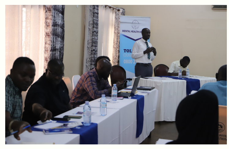
Champions sharing during the project launch

It is also aimed at improving the public's knowledge on mental health, change their behaviours towards people with experience of mental health problems and enhance access to care for the affected persons and promoting evidence-based data, Monitoring and Evaluation.