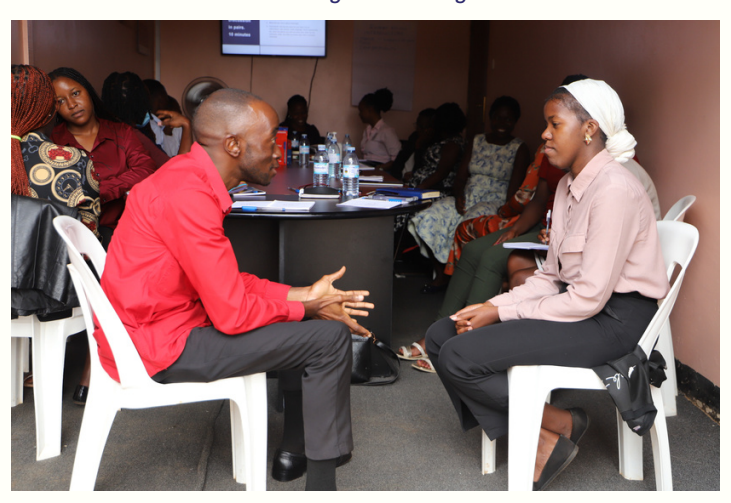
Volunteers conducting a role play during the training