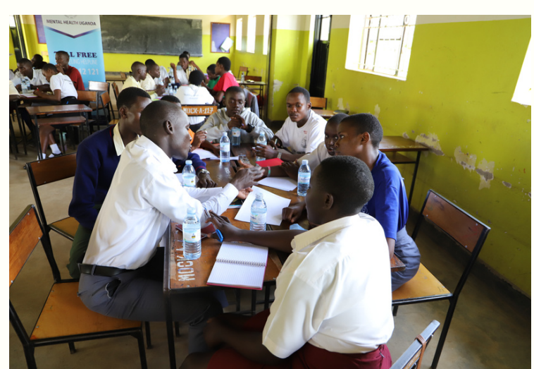
Mental Health Champions in a group discussion in Wakiso during the training