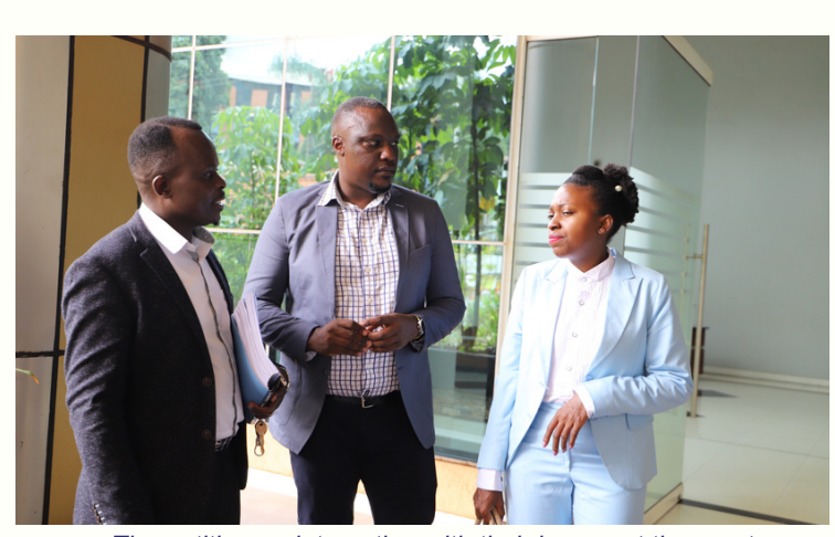
The petitioners interacting with their lawyer at the court

The activists pleaded that the law opens up to allow those ideating suicide to receive help and mental health support from professionals and communities to overcome what they may be going through.